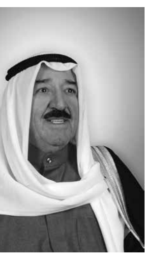
H.H. Sheikh Sabah Al Ahmad Al Jaber Al Sabah Amir of the State of Kuwait